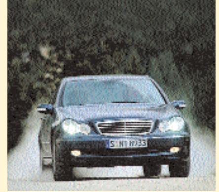
Right: Mercedes-Benz C320 Sedan; far right: Pontiac Sunfire