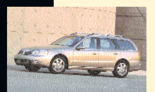
Saturn L-Series Wagon