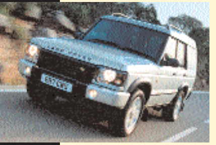
Land Rover Discovery

the Hydra-Matic 4T40-E automatic transmission and are approved for flat towing, as are those equipped with manual transmissions.