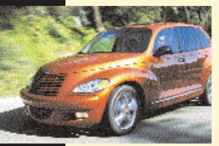
Chrysler PT Turbo