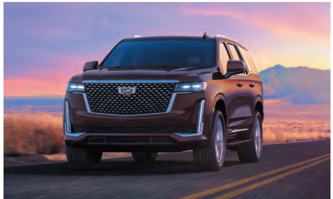
⬆️ Cadillac Escalade