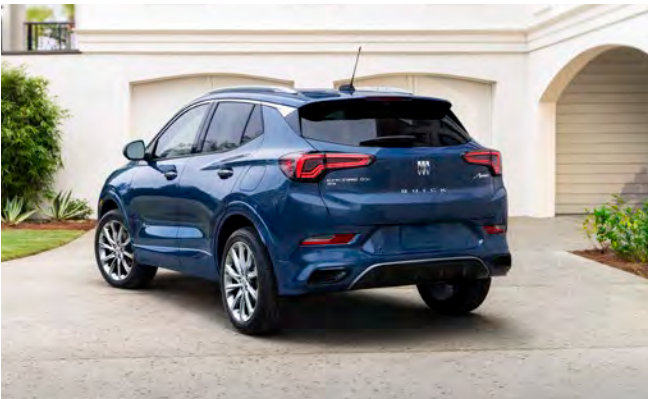
⬆️ Buick Encore GX

Escalade/Escalade ESV 4WD: Only dinghy tow four-wheel-drive vehicles with a two-speed transfer case that has an N (neutral) and 4L (four-wheel-drive low) setting. Shift the transfer case to neutral, transmission to P (park). Disconnect the negative battery cable and cover battery post with a non-conductive material to prevent any contact with the negative battery terminal.