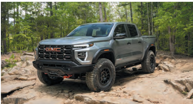
↑ GMC Canyon

Maverick Hybrid FWD: Put climate control system in recirculated air mode to prevent exhaust fumes from entering vehicle. Select Settings from the instrument display main menu. Select Neutral Tow. Follow instructions on instrument cluster display. Start your vehicle at the beginning of each day, and every six hours or fewer. Before continuing to tow, switch Neutral Tow on and keep the vehicle on for three minutes.