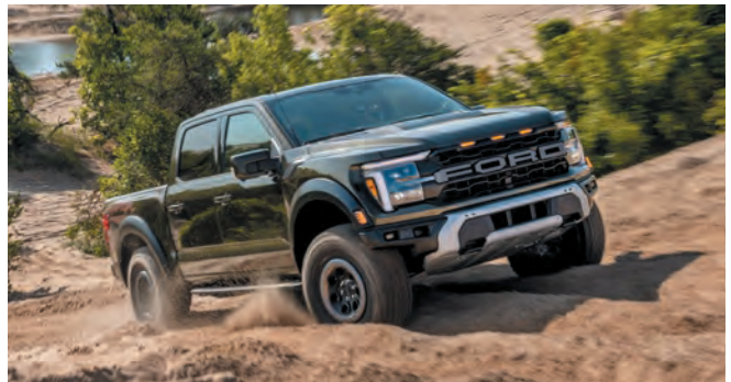
↑ Ford F-150 Raptor