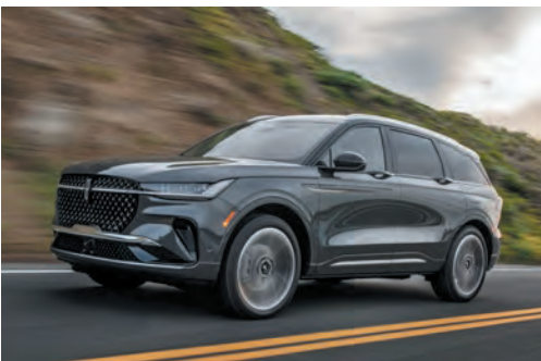
⬆️ Lincoln Nautilus