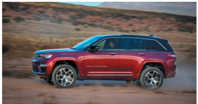
↑ Jeep Grand Cherokee