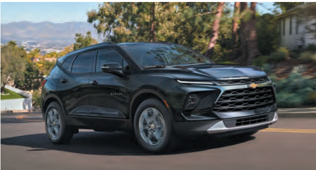
↑ Chevrolet Blazer

Trax FWD: Shift transmission into neutral and turn vehicle off. Disconnect the negative battery terminal and cover the negative battery post with a non-conductive material to avoid contact with the negative battery terminal.