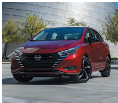
⬆️ Nissan Versa